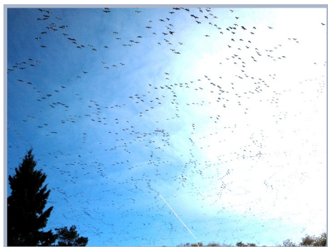
Flocks of geese filling the sky

There is a voice that God has put deep within these amazing creatures. They hear the call when it is time to travel on. Following this instinct placed by the Lord, they find their direction, make their departure, and aim for their destination.