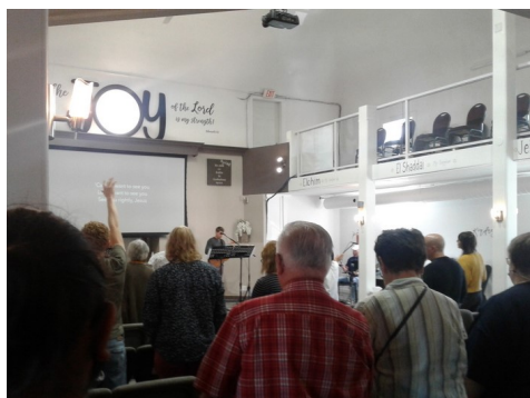
Worship together in Saskatoon, SK

The original plan was also to be in Calgary for several days of ministry. However, these plans were cancelled quite suddenly when new restrictions were put in place because of the devastating fourth Covid wave in Alberta. In a last minute change, I received an invitation to share in The Pas, MB.