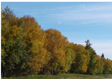
Beautiful Autumn colors on the road to The Pas, MB

The autumn colors are beautiful. Everywhere we can see the handiwork of God. In the busyness of life it is good to pause and reflect on His greatness and goodness. There is a great country gospel song that reminds us to live "One Day at a Time". With all the uncertainties of our world we find God faithfully supplies strength and courage just for today!