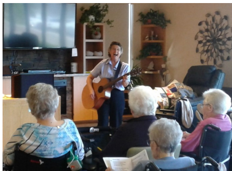
Sharing gospel music in the Senior's Home

There was divine guidance in the changed plan with a precious awareness of His hand directing every detail. There was great fellowship and ministry in the well-attended Ladies Brunch on Saturday morning. The Lord met with us in each service and there was a great assurance of the Lord working in hearts.