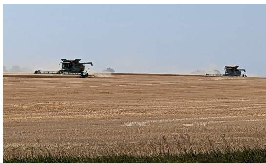
Harvest time in Saskatchewan

The month of August seems to have zipped past! Every weekend I have been ministering in churches nearby. Many folks have informed me they were deeply challenged and re-ignited by the Word of the Lord. There have been some exceptional moments of Holy Spirit visitation as well.