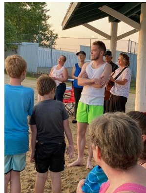
Leroy outreach baptismal service